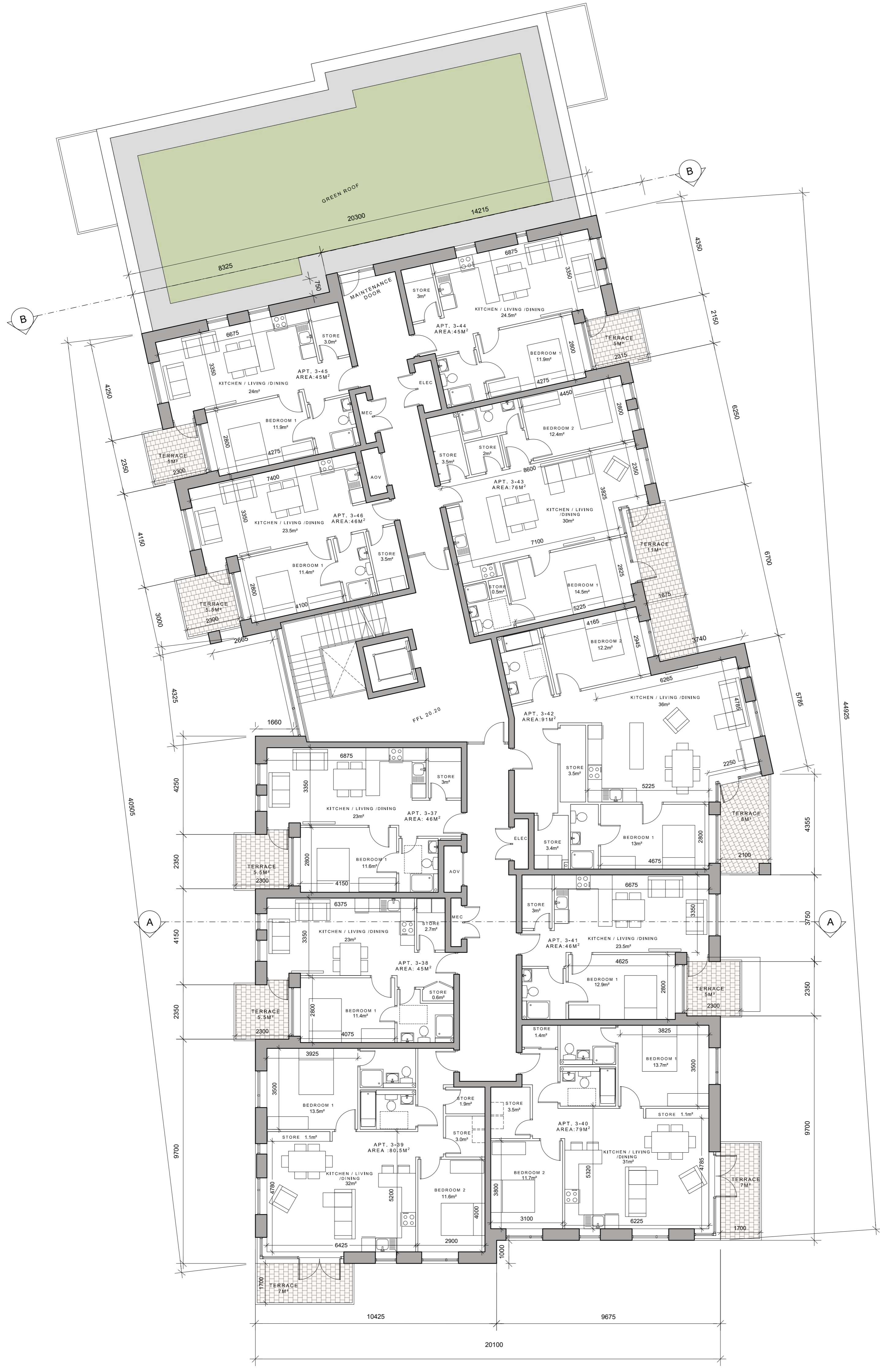
BLOCK 3 THIRD FLOOR PLAN SCALE: 1:100